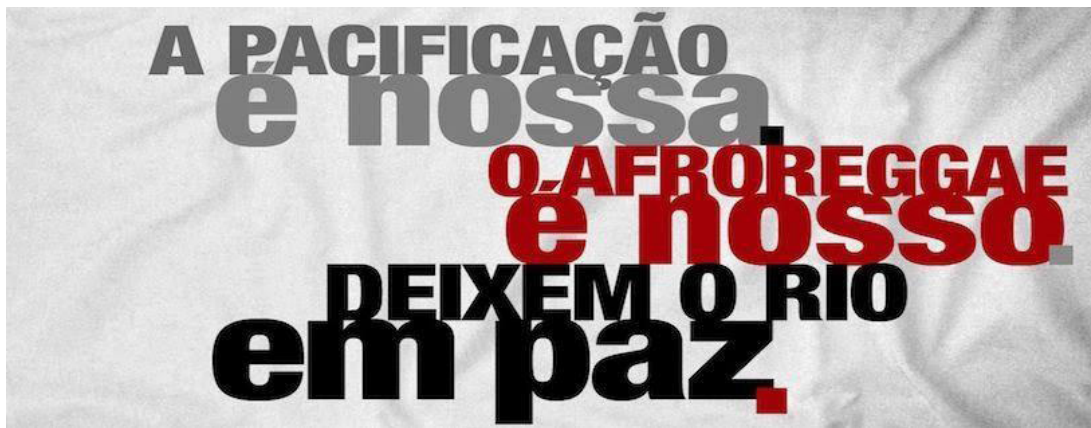
Pacification is ours. Afroreggae is ours. Leave Rio in Peace.

The fear of the dissolution of the police pacification units reached not only residents of the “pacified” favelas, but also artists, business people, athletes, professionals and social entities that had publically defended the project in the second half of 2013. A group of city residents decided to create a “protection network” for the pacification units as indicated in the article in the O Globo newspaper of August 24, 2013. They launched the “Leave Rio at Peace” movement, which arouse as a reaction to the “traffickers attacks” on the offices of AfroReggae in the Complexo do Alemão in late July.